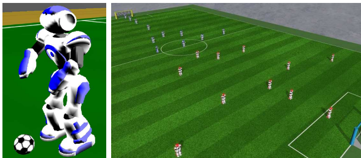
Figure 1. On the left is a screenshot of the Nao agent, and on the right a view of the soccer field during a 11 versus 11 game.